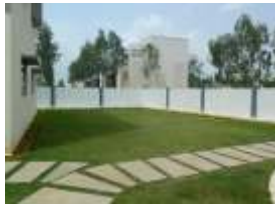
Lawns for Banquets