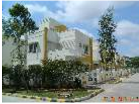
Villa No. 15