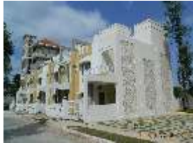
Villa No. 20 - 23