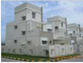
Villa No. 55