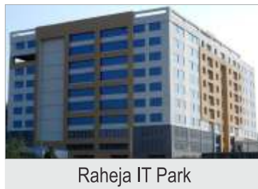
Raheja IT Park